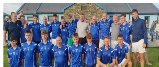
Beara Champions - Bere Island Junior C Team