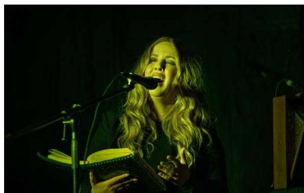
Venue: Lecture Theatre Lisa Lambe - Night Visiting Performance

BIPG are organising a number of courses and workshops for the New Year. If there are any courses, you would like to see run please contact the office on 02775099 and we will try to arrange them. (Submitted by BIPG)