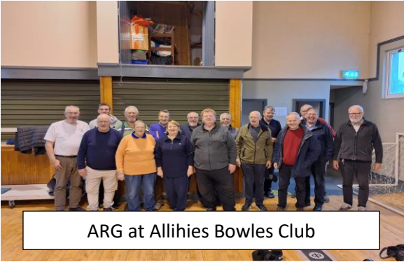
ARG at Allihies Bowles Club