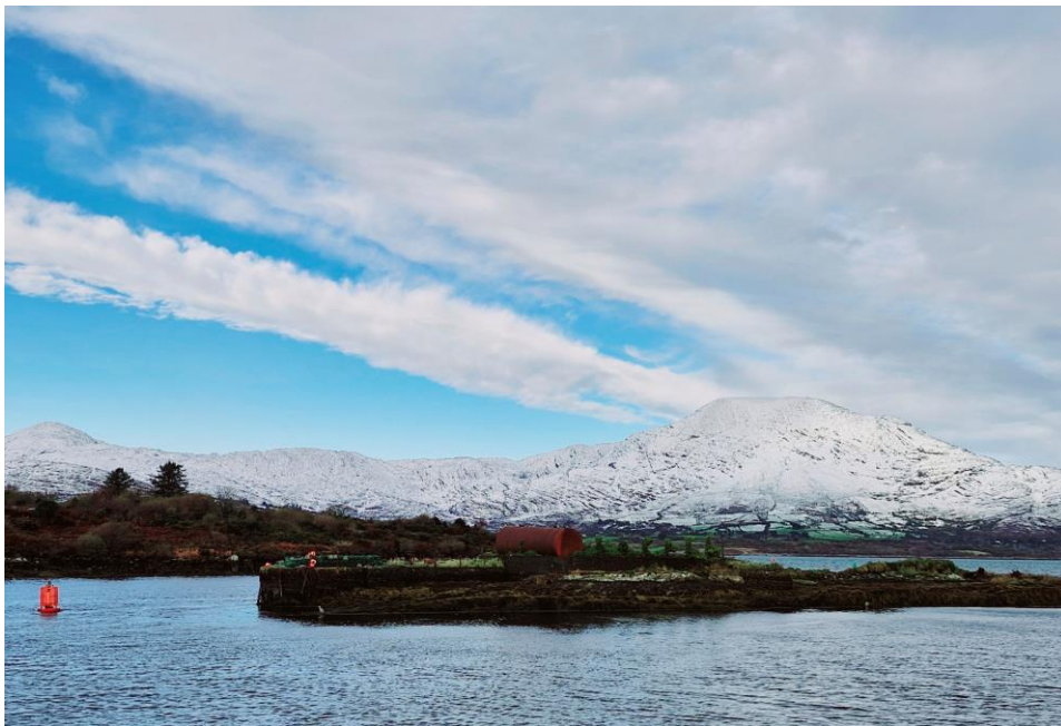
Above: Snow on Hungry Hill 21/11/2024 ☑ Photo by Leila Sidley