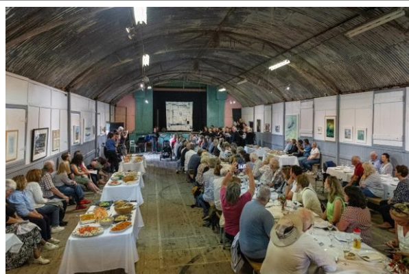
Venue: Drill Hall Long Table Lunch Art Exhibition: 7 West Cork Islands