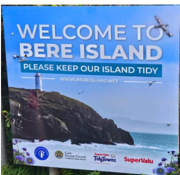
Photos : Left – New Welcome to Bere Island signs with thanks to Murphy's SuperValu Cork County Co Co. Right – Community efforts around the island in preparation for the Tidy Islands.

The Bere Island Tourism and Environment Group would like to wish everyone a very Happy Christmas and a Healthy and Happy New Year.