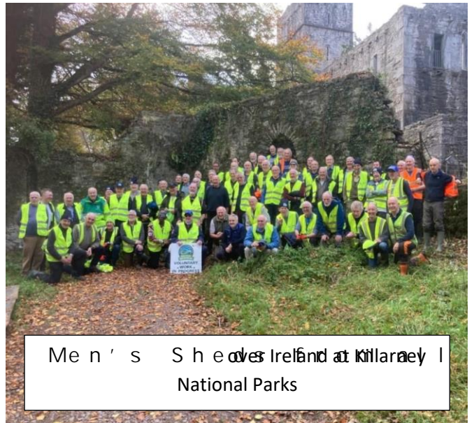
Men's Sheds Ireland at Killarney National Parks

The Bere Island Men's S Thursday night at the community centre at 7.30pm. New members are always welcome.