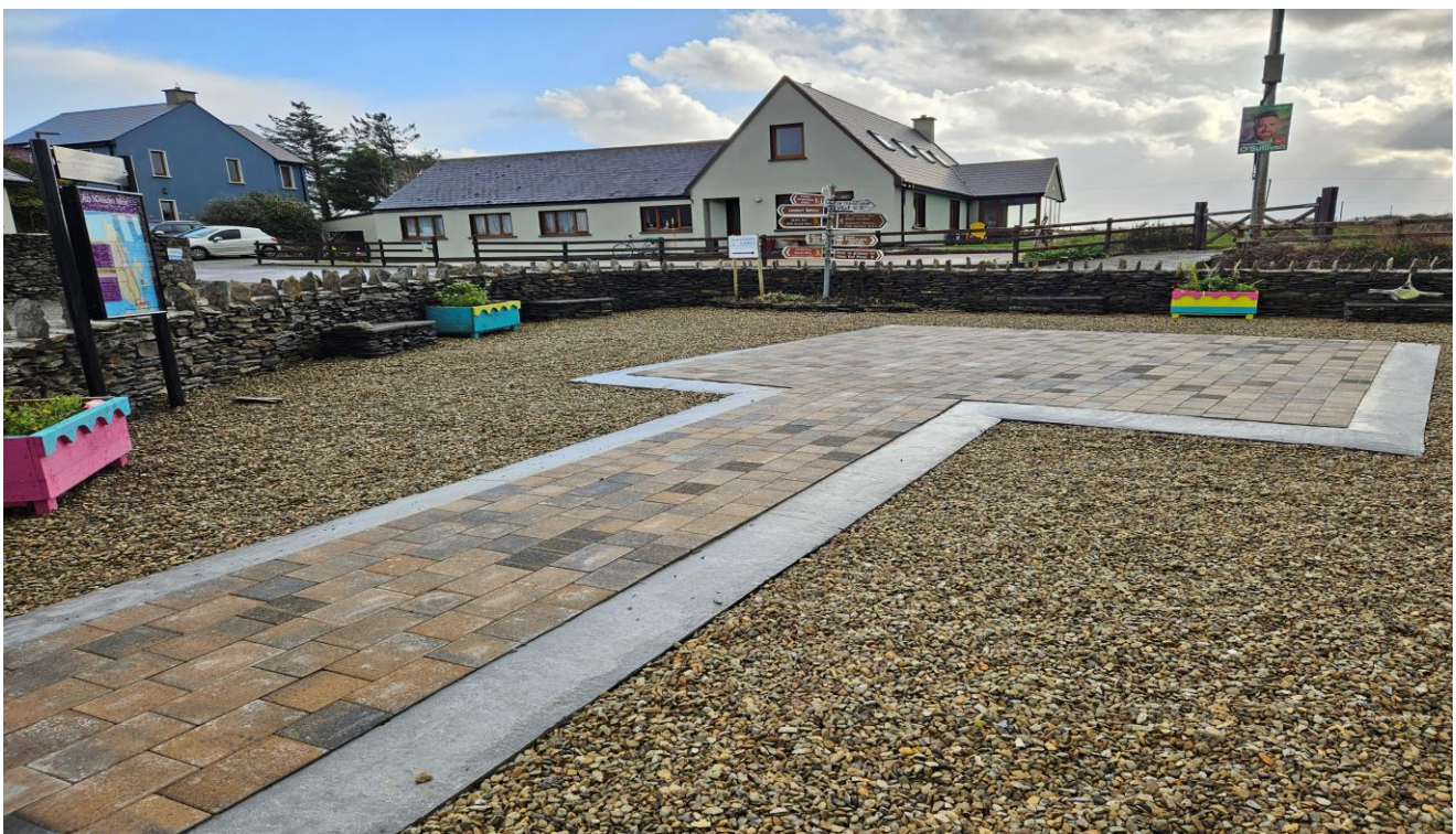
The amenity area at Rerrin recently got a much needed tidy-up and renovation. Thanks to Ability Contracting for completing the work.